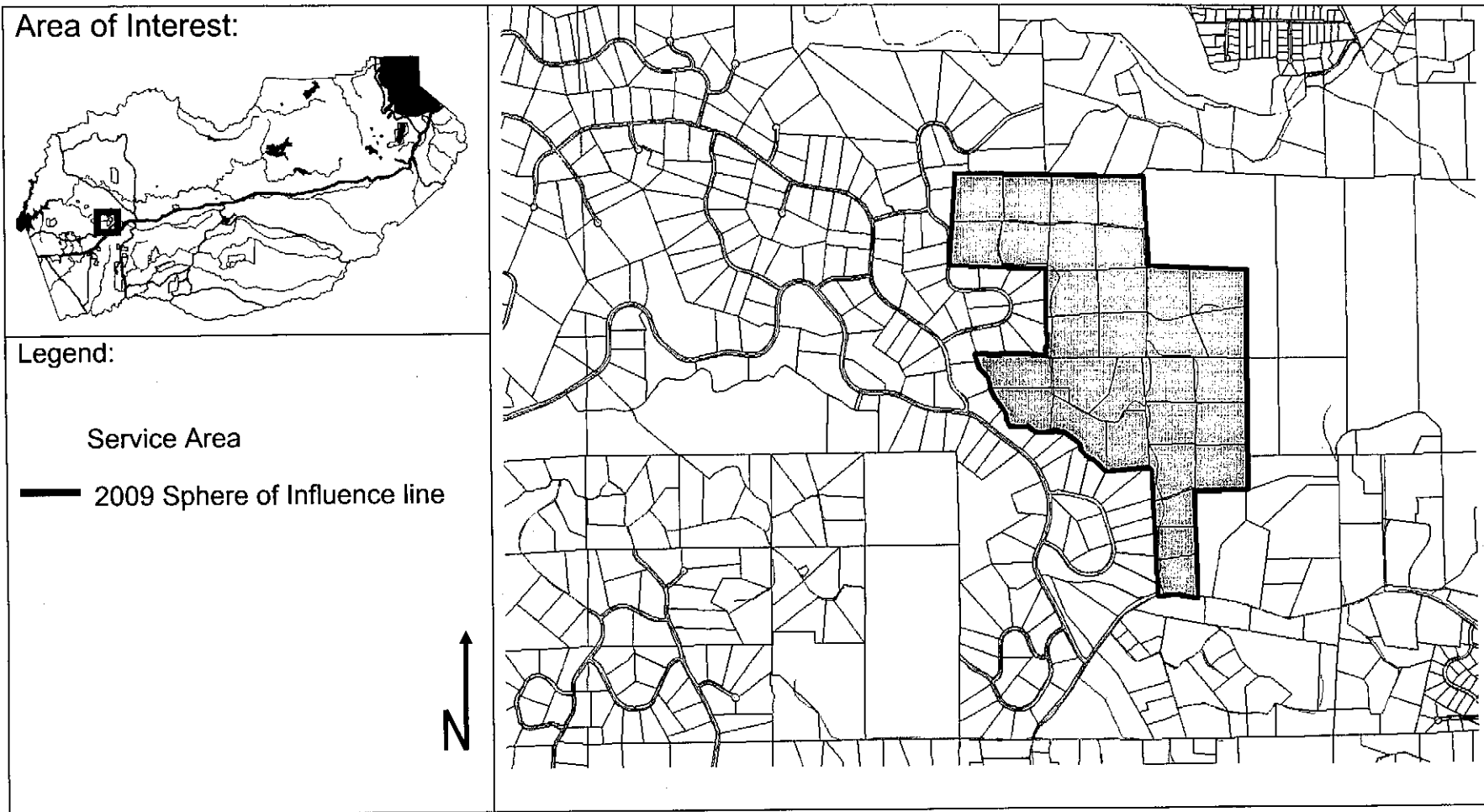
Exhibit A – Mortara Circle Community Services District