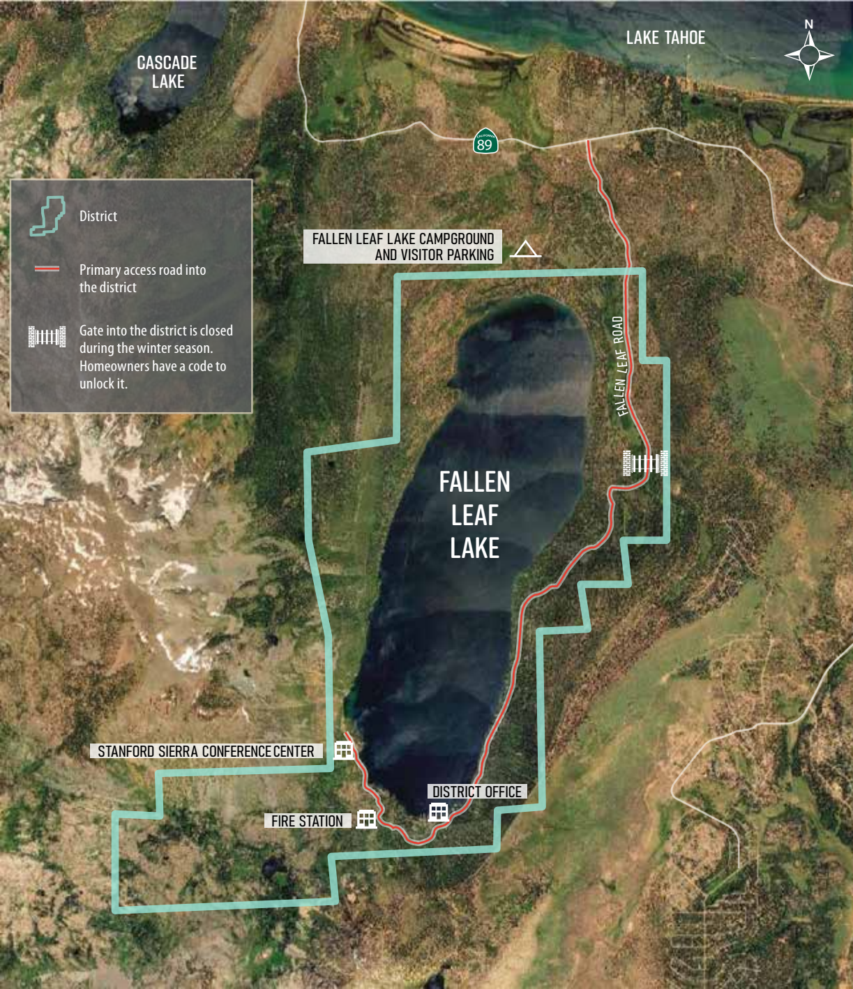
Figure 1 The District's Boundaries